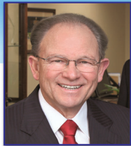
CA Insurance Lic. #0B38656