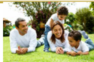
Natural Family Planning, Love, Mercy, Life, opening the heart of marriage.

http://www.usccb.org/issues-and-action/marriage-and-family/natural-family-planning/